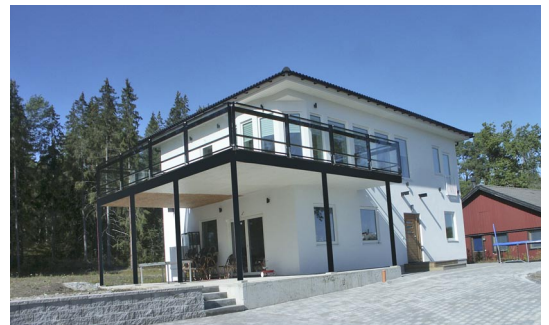
Villa in Stockholm, Sweden