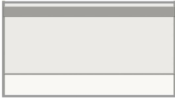
Lowered position with glass