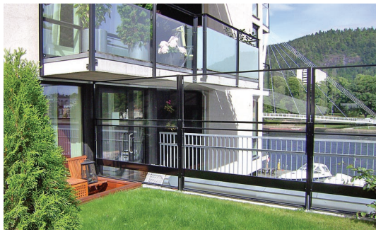
Terrace in Norway