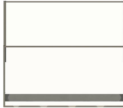
Raised position with glass