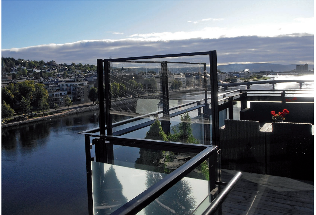
Balcony in Norway

THE WINDSCREEN THAT RISES ABOVE THE AVERAGE